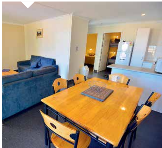
Deluxe Family Cabin

Air-conditioned two bedroom with queen bed in master bedroom and double bunks in second bedroom, private ensuite, open plan kitchen, lounge and dining, TV/DVD. Verandah and outdoor setting.