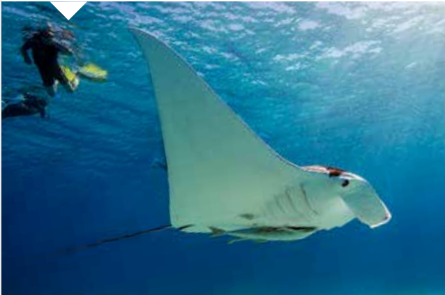
Snorkel with the Manta Rays