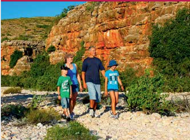
Cape Range National Park