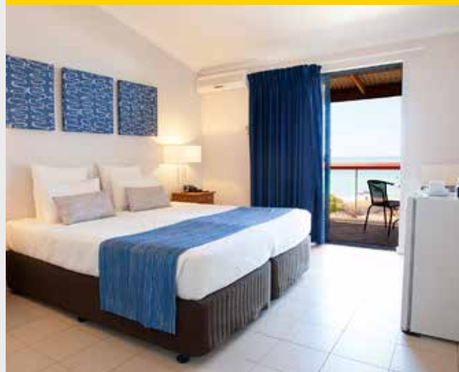
Beach View Room

Comprises of two Garden View Rooms sold as one unit – a great option for families and includes two bedrooms; each with queen beds, one single bed and optional trundle bed. Room facilities include; air conditioning, flat screen TV with complimentary movie channels and tea, coffee and toast making facilities.