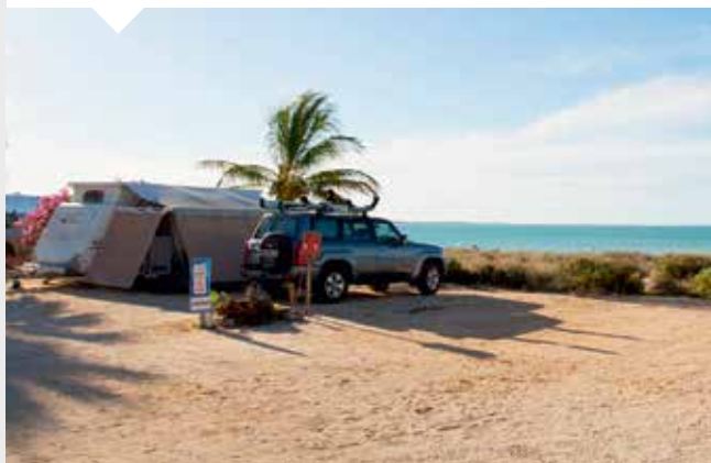
Caravan and camping sites